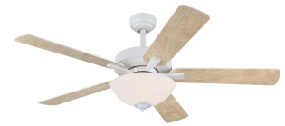
Reversible Light Maple Finish Blades